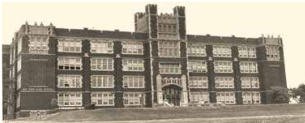
Top: Fritsche Junior High School in 1963. Today it is Milwaukee Parkside School for the Arts. Bottom: Bay View High School before the 1975 addition.