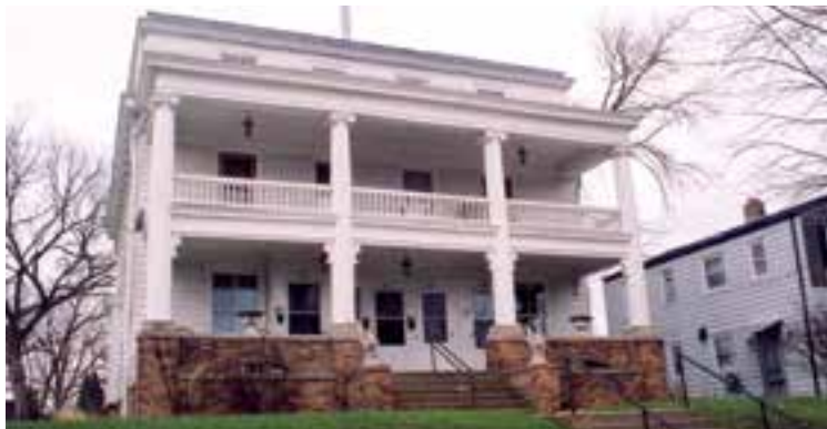
The Henry Mann Mansion (1895), 2931 South Logan Ave., is across the street from the Bruno Nordberg home.

Length of the walk is approximately two miles and will cover the area from Howell Avenue to the Lake Parkway and from Oklahoma Avenue to Montana Street. Learn about Humboldt Park, one of Milwaukee's five original parks created in 1890. Other sites include the Eugene Jewell Home, Henry Mann Mansion, Bruno Nordberg Home, Jacob Kwarigrock Cottages, Graham's Subdivision and Sijan Field.