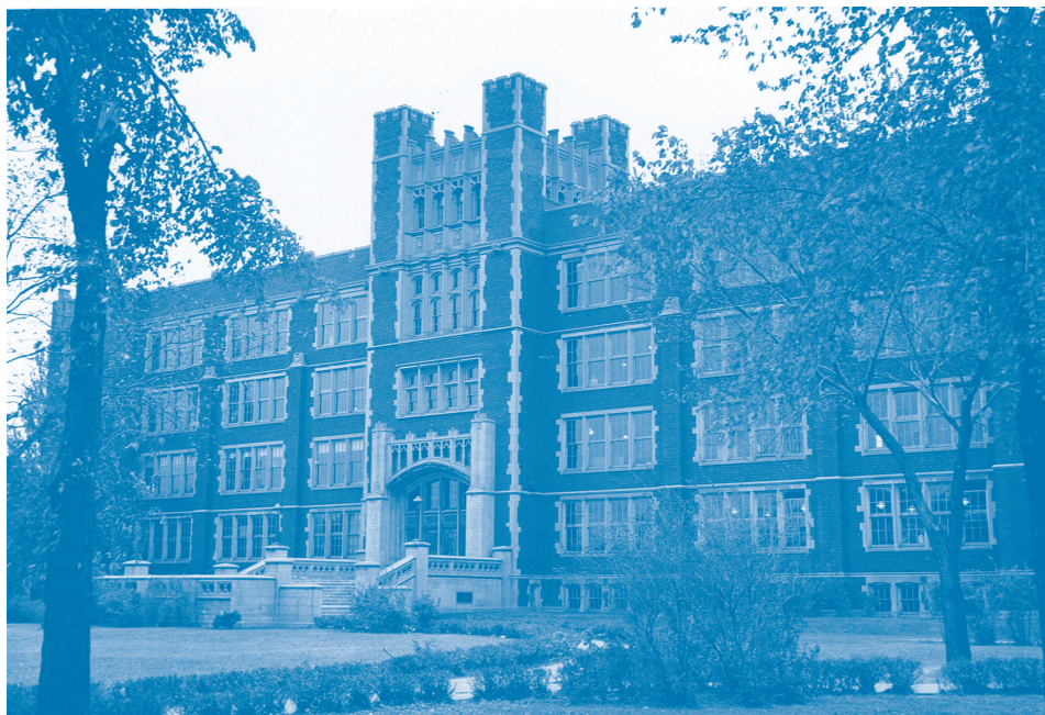
This view of the "The Castle on the Hill" is no longer possible thanks to the 1975 "Box that blocks the view."

Even if you didn't graduate from Bay View High, you will enjoy seeing and reading the sections about world, national, and local events during the past 100 years and seeing the changes that took place. Cost for the book is $35.00 and the book order needs to