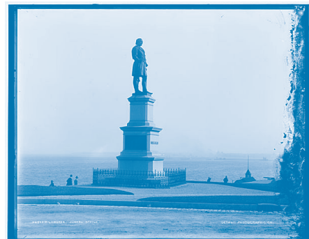
Solomon Juneau Statue in 1890.

Solomon Juneau was born in L'Assumption on August 9, 1793 and was to become a fur trader with the American Fur Company and established a Trading Post in Milwaukee in 1818. He soon saw a future in Milwaukee and purchased the land between the Milwaukee River and Lake Michigan, platted it, and named it Juneau Town. He became the first postmaster and the first president of the Village of Milwaukee and in 1846 was elected the first mayor of the City of Milwaukee.