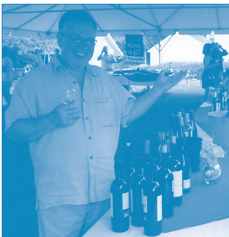
Don't miss this year's Annual Wine and Beer Tasting Event! Space is limited.