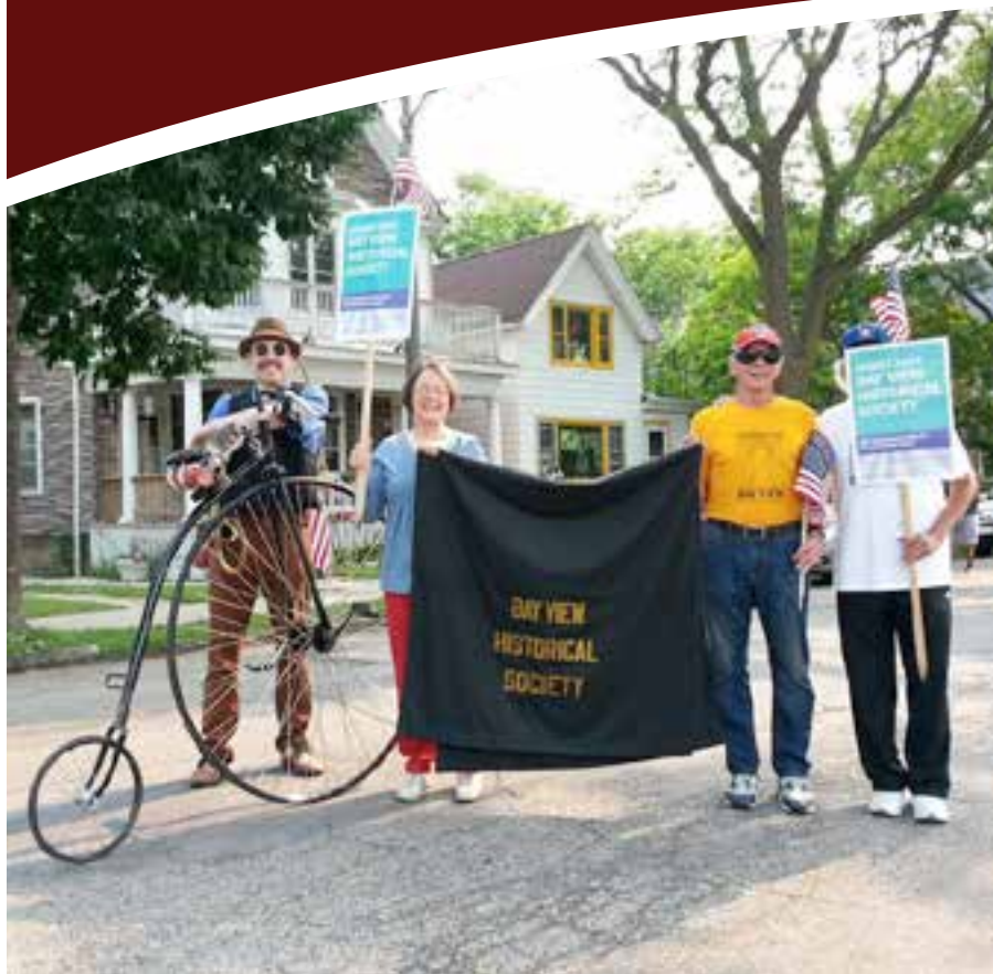
4 th of July Parade - Humboldt Park!