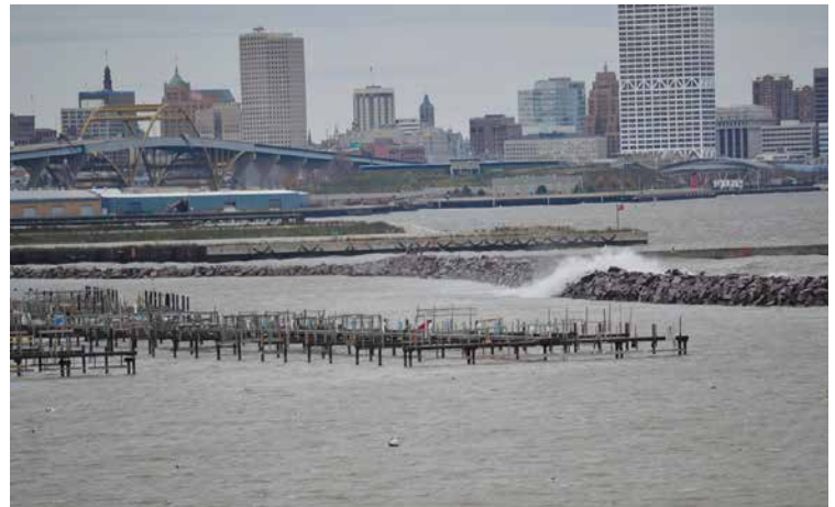
Milwaukee Bay 2014